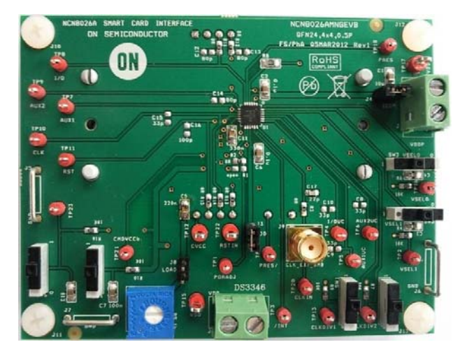
Figure 1. Evaluation Board